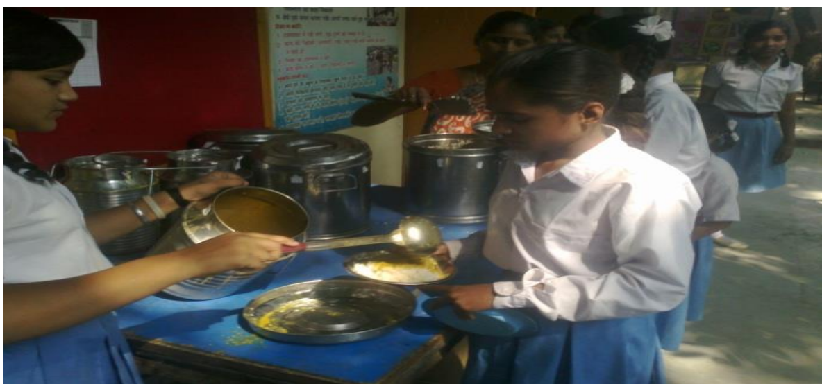
Photo: MDM distribution among Children: Govt. Girls Middle. School, 22-B, Dev Nagar Dated:- 21.10.2013 .

It was observed by MI during sampled school visits that generally two puris per head are served from class1 to class 5th, and 2 to 3 puris from classes 6 to 8. Nearly 64% of primary school children informed two puris per head as too less for them. Similarly, Nearly 72% upper primary children informed that 2-3 puris per head were insufficient. MI discussed with upper class children and found they were not aware of cooked meal quantity prescribed by department for them. MI suggests cooked meal quantity should be display along with MDM