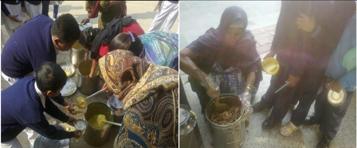
Photo No.1-Rice and Curhi Mixed prior to serve among children Govt. Co ed School Baprola Vihar Dated:- 16.11.2013