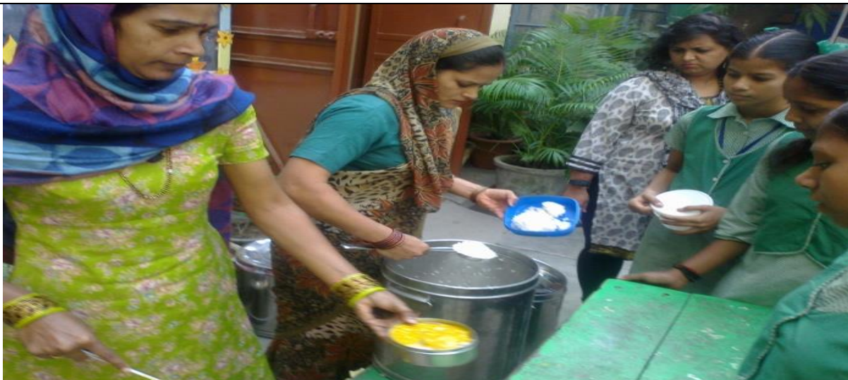
Photo: MDM distribution among children :Govt. Girls Sr. Sec. School, Ram Nagar Dated :- 29.10.2013