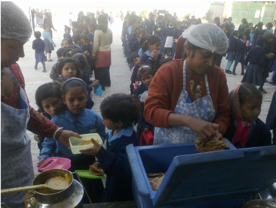
Photo No.2. 1-Rice and Rajma Mixed prior to serve among SDMC boys Primary school JaiVihar Baprola Extention , Dated:- 26.11.2013